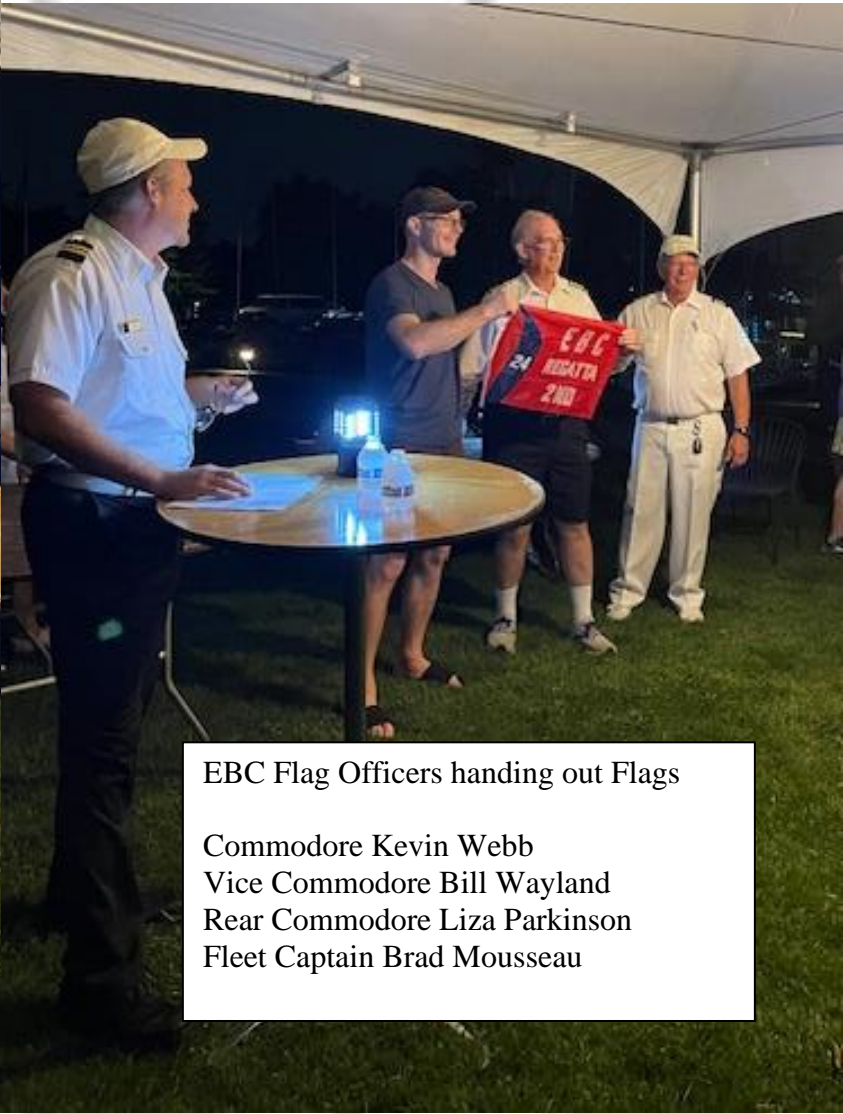
EBC Flag Officers handing out Flags