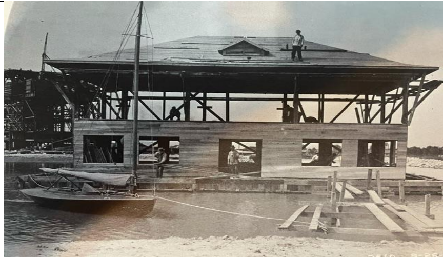
Clubhouse in process 8/26/1914